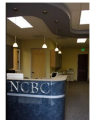
NCBC Catalogue 19